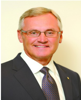
Thursday's Keynote Speaker Jim Tressel— University of Akron, V.P. for Strategic Engagement

The Medina County Schools' ESC is excited to present the first annual Ohio Educators' Symposium June 17-20. This professional development opportunity will bring in top presenters and keynote speakers from across Ohio to offer dozens of breakout sessions. The four days of in-service will be available on both a credit or noncredit basis. Two credit hours will be available from The University of Akron, and additional online credits will be available to Symposium participants at a reduced rate.