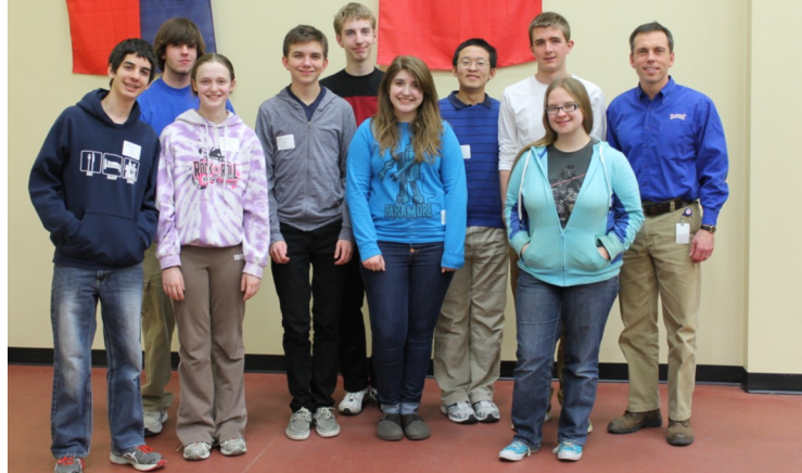
Revere High School Challenge Team

On Friday, February 22, the 27th Annual Medina County High School Academic Challenge League Tournament was held at the Medina County University Center. Participating in the event were stellar academic students from Brunswick, Buckeye, Cloverleaf, Columbia (Lorain County), Highland, Medina, Revere (Summit County), and Wadsworth. The tournament champion, winning seven rounds of play, was Revere High School.