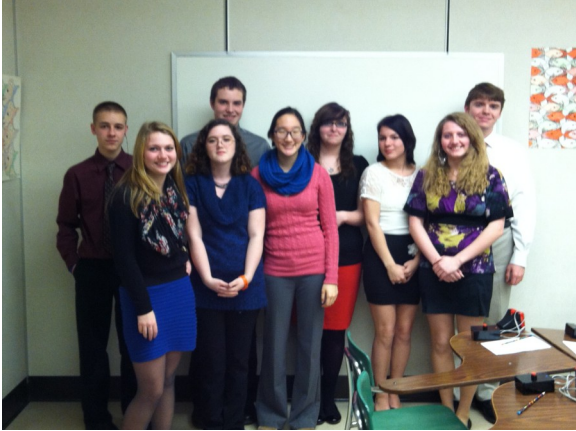
Cloverleaf High School Academic Challenge Team